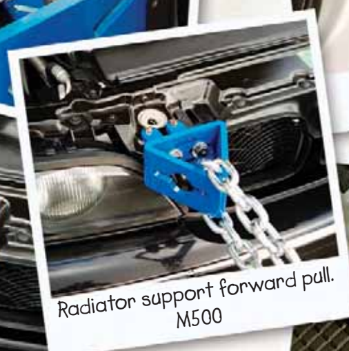
Radiator support forward pull. M500