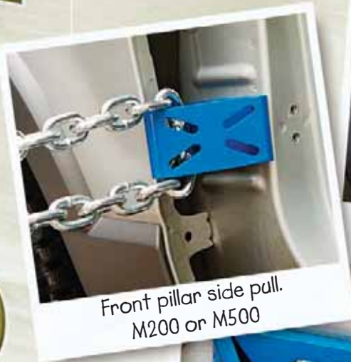
Front pillar side pull. M200 or M500

What more can we say other than... you'll be amazed by how much this small piece of equipment will add to your bottom line! Just look at the possibilities and use your imagination.