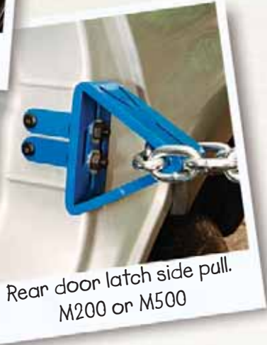
Rear door latch side pull. M200 or M500