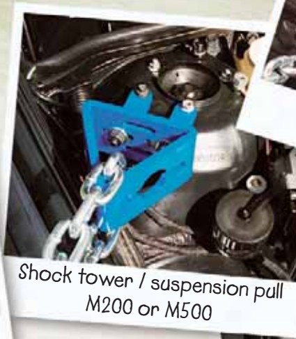
Shock tower / suspension pull M200 or M500