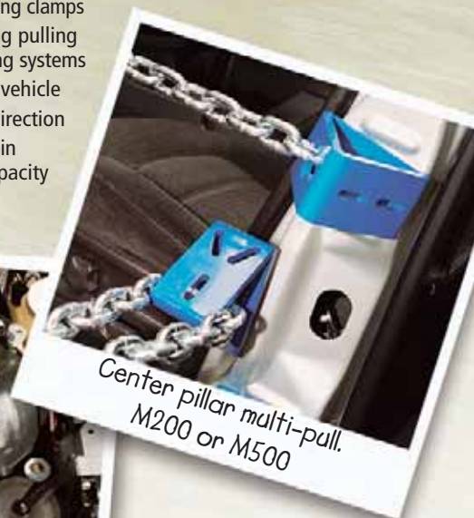
Center pillar multi-pull. M200 or M500