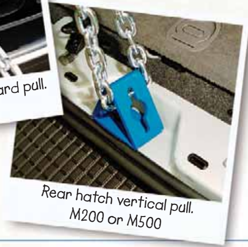
Rear hatch vertical pull. M200 or M500

Manufactured by Hi-Tac Clamp Corporation