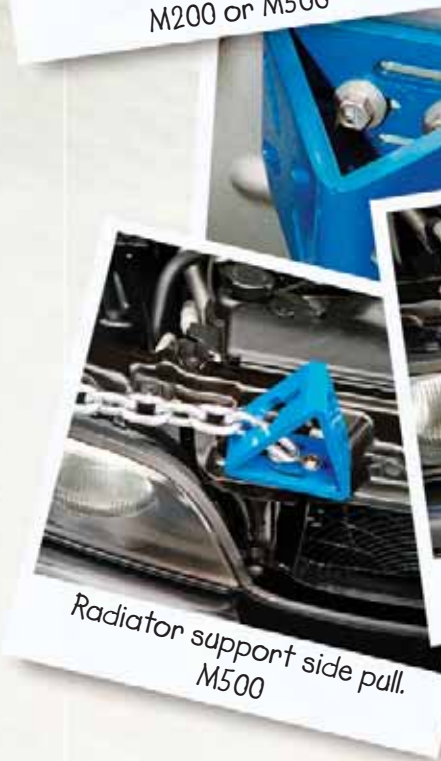
Radiator support side pull. M500